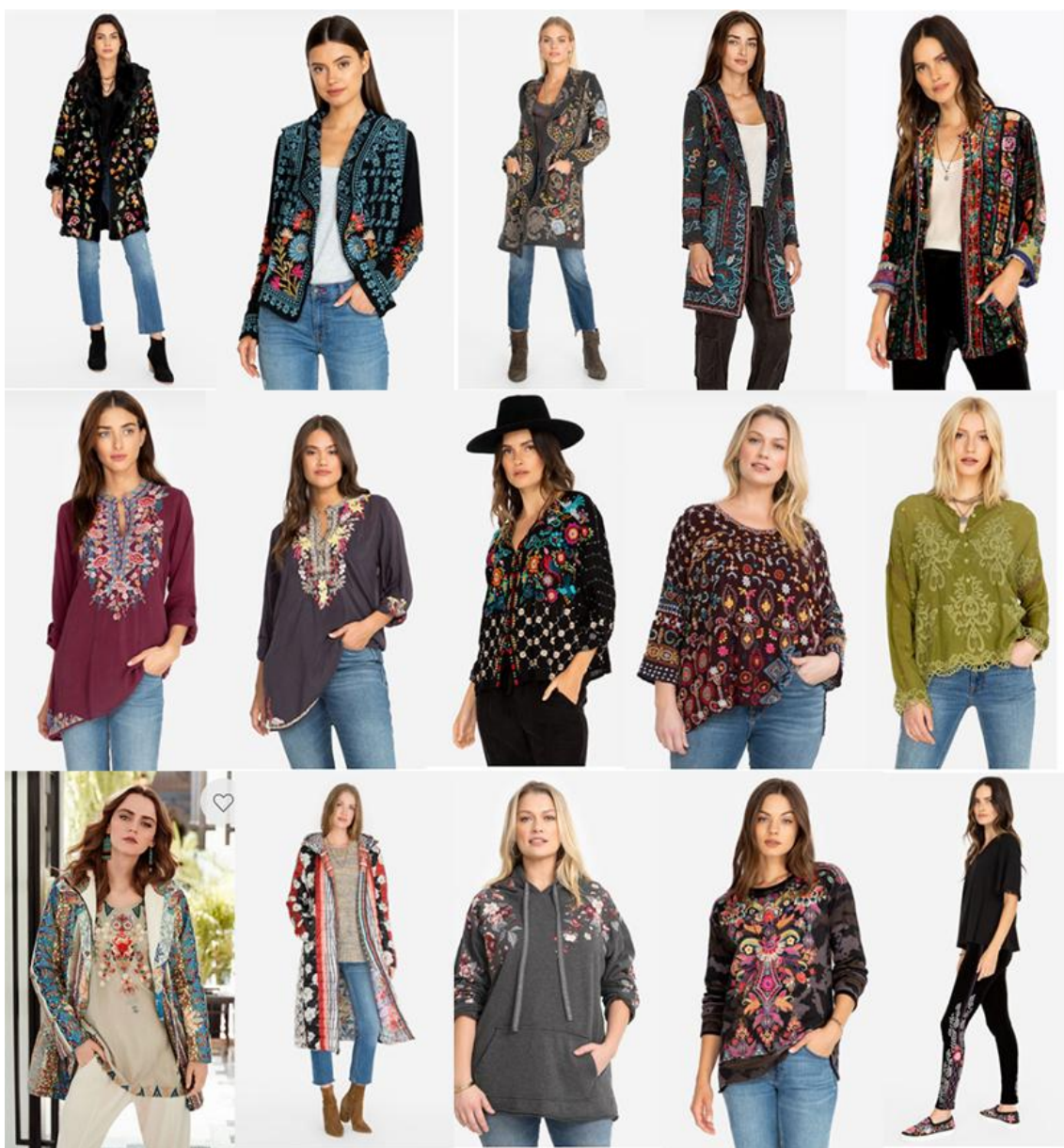
Just a small sampling of new styles in, though not all styles/sizes in all shops.