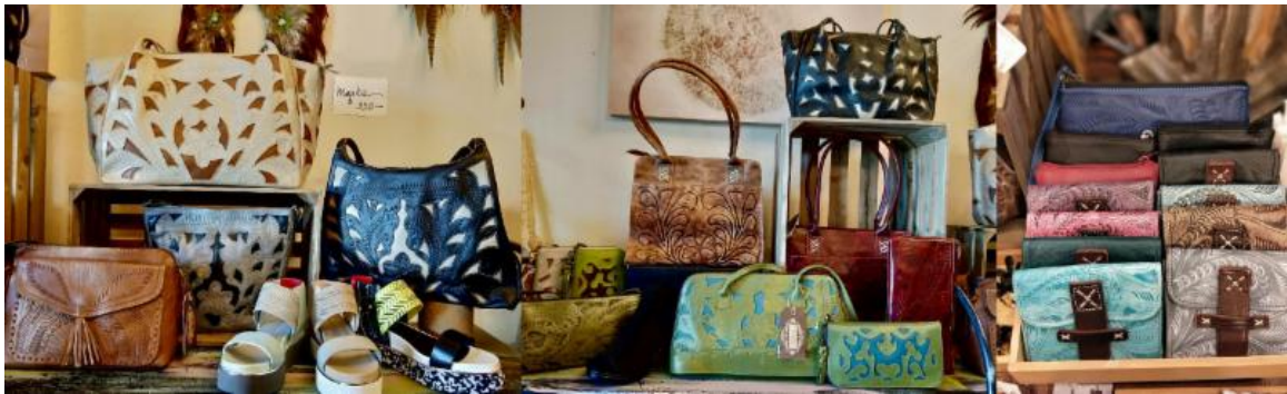
Beautifully crafted Leaders in Leather bags