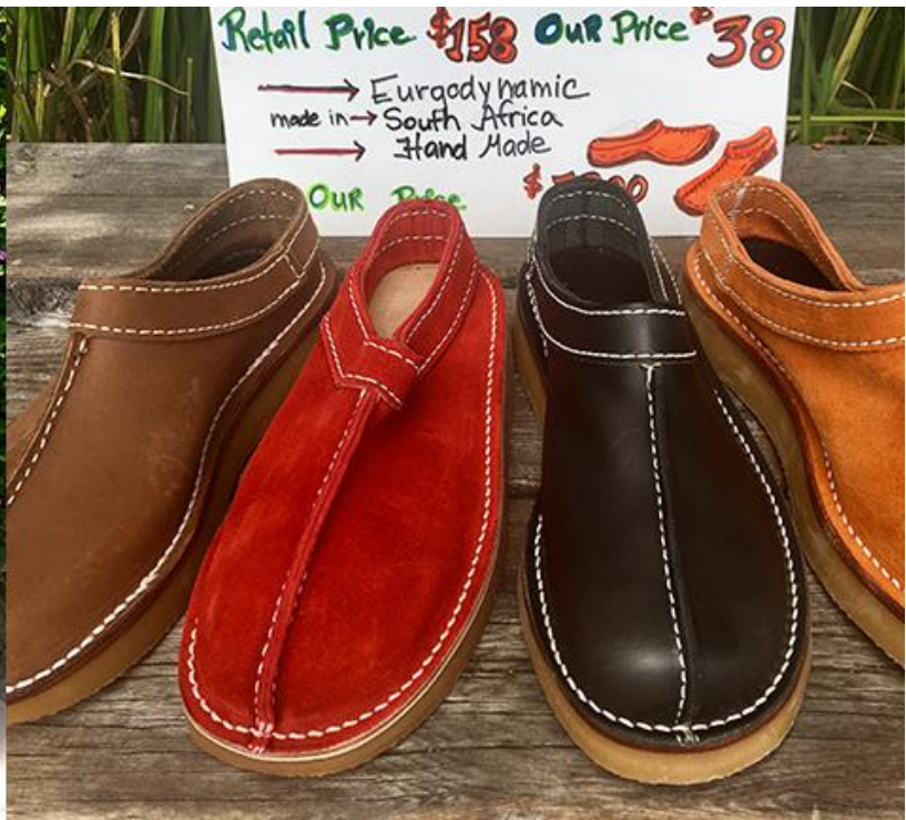
JW Dress, Bernie Mev Shoes, Sunhat I picked up in a craft market in Ibiza, South African hand made and sewn, ergonomic shoes.