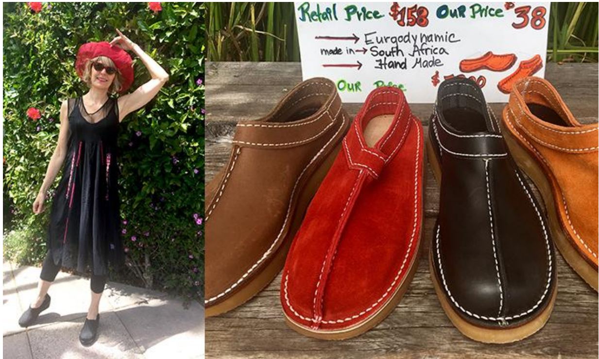
JW Dress, Bernie Mev Shoes, Sunhat I picked up in a craft market in Ibiza, South African hand made and sewn, ergonomic shoes.

also be worn as a dress. The top is actually a great dress above the knee. This also comes in a 3/4 sleeve version. This dress is made casual with these comfy shoes, bracelet and tribal necklace, worn by Heather.