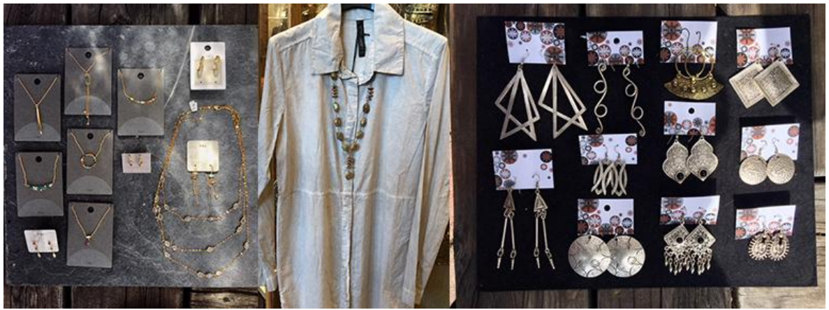
Italian shirts on $38 rack with Jan Michaels green Turquoise and wood necklace