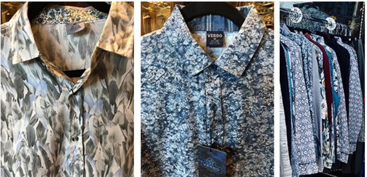
These fabulous shirts normally sell at around $59