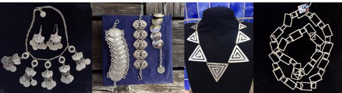
Fun statement pieces at great prices made in Turkey