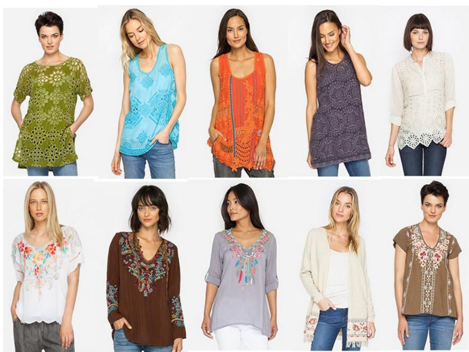
Heather in Biya dress ... those balloons in Berkeley mean additional 50% off! LOVE