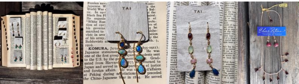
Delicate gold filled with semi-precious stones by small biz designers