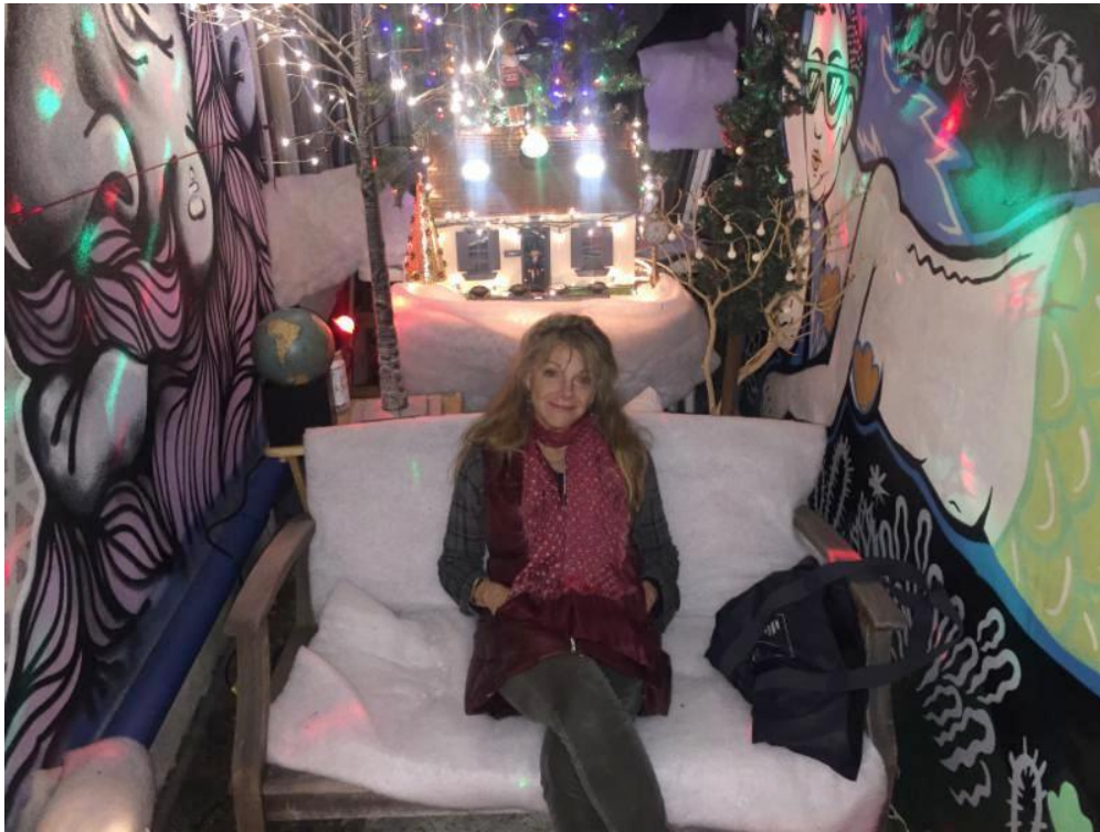
at Mom & Pop Shop Holiday Alley Pt Richmond