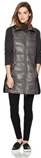
Light weight with reflective zippers, packs in a small cool bag