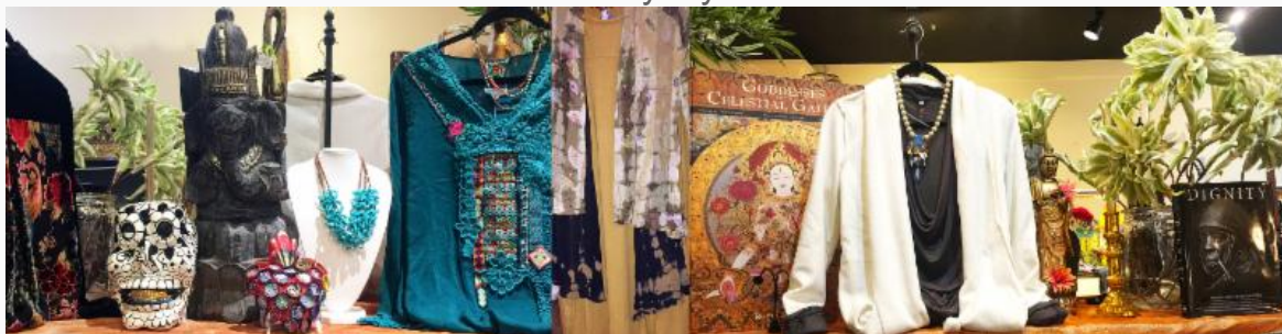
A peek into the shop