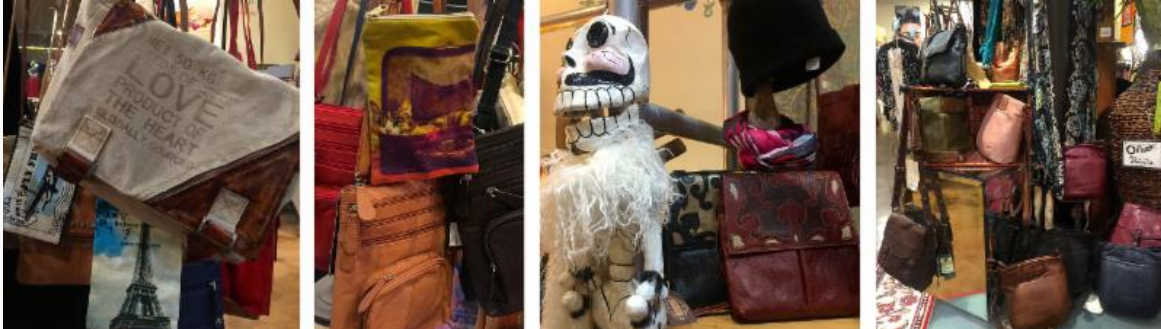
Canvas bags of Love made by recycling army tents, inexpensive leather bags and leather bags hand tooled by Leaders in Leather and soft leather imported from Germany, Aunts & Uncles