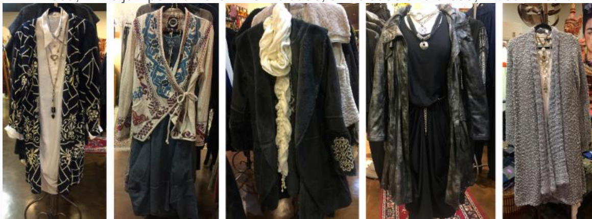
Coats and Jackets by Biya & Pile ou FACE