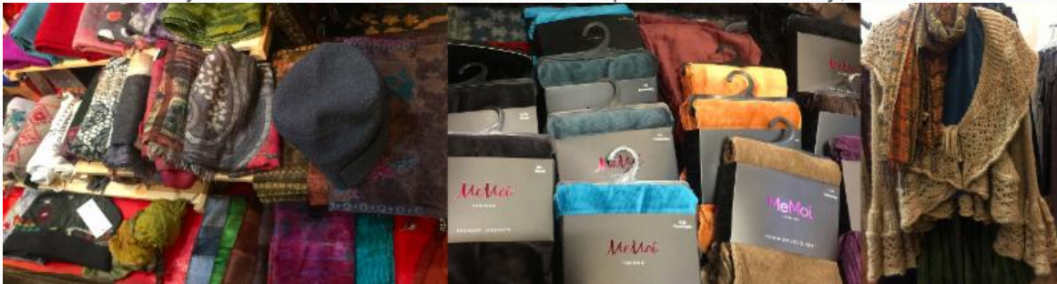
Beautiful wool and silk scarves and hats, MeMoi corduroy leggings (BOGO)