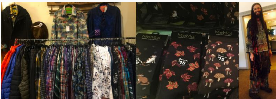
Men's jackets, shirts, hats, me moi socks BOGO, cashmere scarves ... or the whole store is your oyster like this joyful wizard wearing a Citron Magic robe