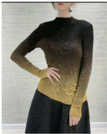
Above New Johnny Was Below a few Vanite