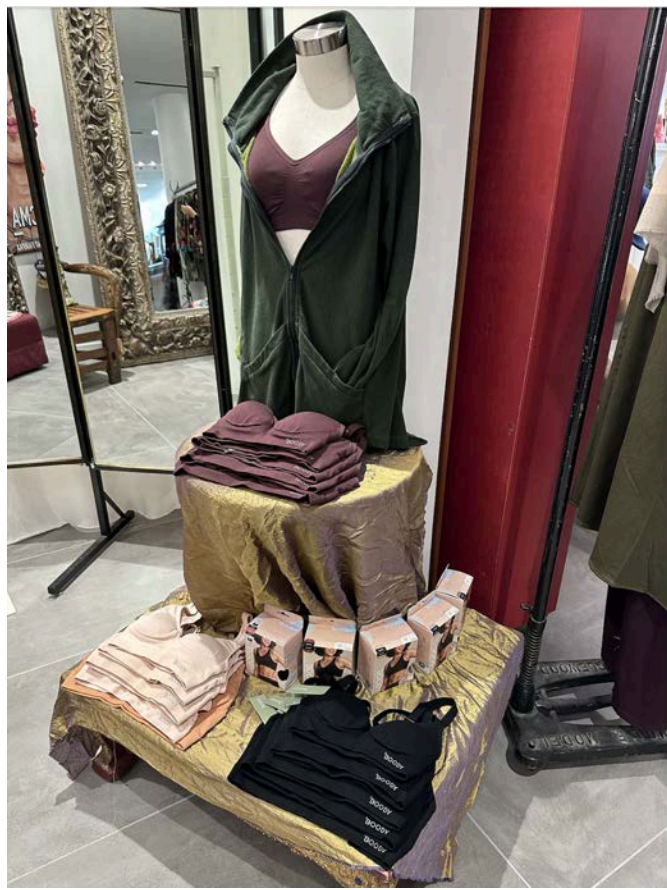
The most comfortable and supportive, no underwire bras in BAMBOO! (not nylon) removable pads. Now added low back bra and fabulous fit undies!