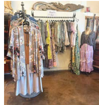
Citron Kimono, Devitalia palazzo pant and tank, Magnolia Pearl rack