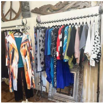
Vanite coats skirts pants tops dresses rack