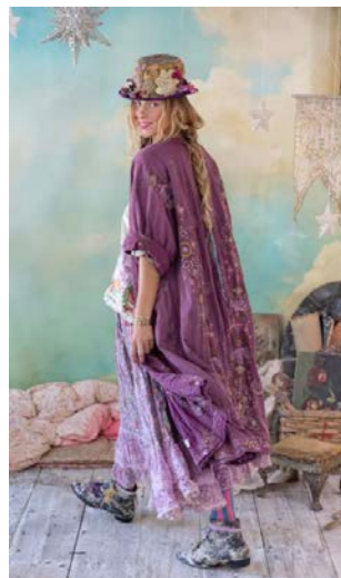
Vanite tops, dresses, pants (also shown) all shoes, jewelry and artisan handmade hat