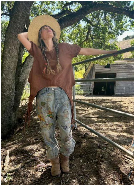
Magnolia Pearl Jean Pant Devitalia linen drawstring top