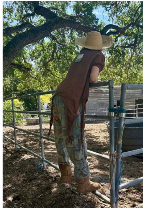
Devitalia linen tie top Magnolia Pearl jean pant