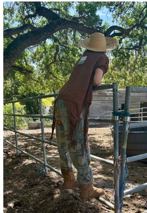
Devitalia linen tie top Magnolia Pearl jean pant