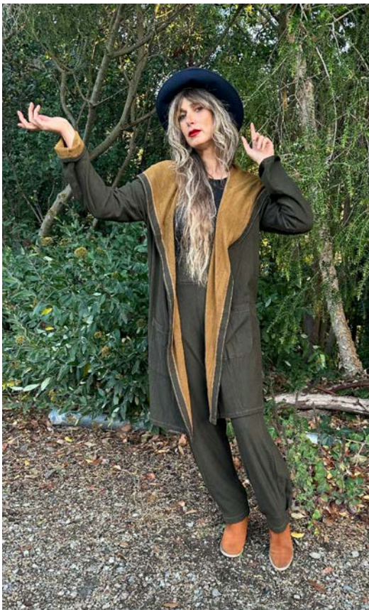
Cozy Hoodie Coat and Peaceful Samurai Pant Pant: $89 now $75 (previous $158) Coat: $128 now $89 (previous $238)

Jacket: $118 now $82 (pre $218) Pant: $85 now $59 (pre $138)