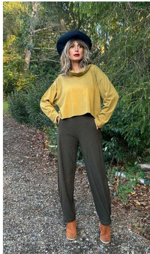
80's style Cowl Top organic cotton locally produced and Peaceful Samurai pant. Top: $98 now $68