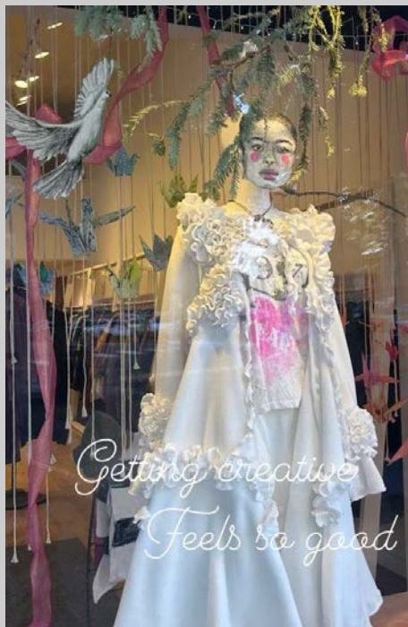
Window by Shaye - Cari Borja fleece Coat - Magnolia Pearl Heart T - Devitalia corduroy skirt - Tara lotus necklace