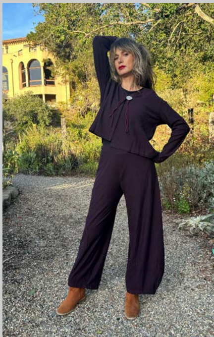
Fly Crop Jacket and (Grow with the) Flow Pant

Hoodie: ($98) now $68 Pant: ($89) now $62