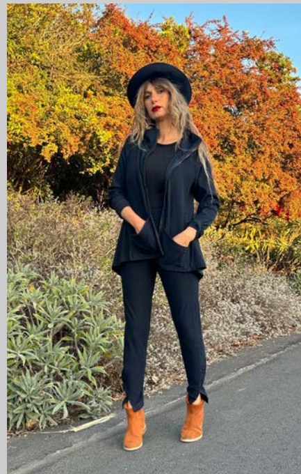
Funnel Neck Zip Jacket and Poet Pant

Hoodie: ($98) now $68 Pant: ($89) now $62