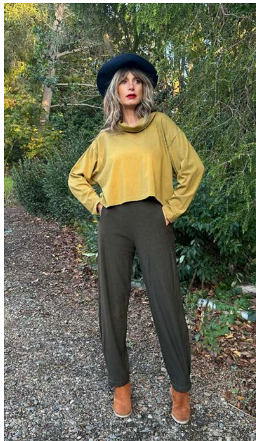
80's style Cowl Top organic cotton locally produced and Peaceful Samurai pant. Top: $98 now $68