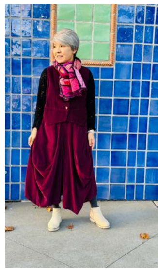
Wool tee shirt, cord vest, Cord skirt and boilded wool art scarf

Shop online: Outback in the Temple of Venus