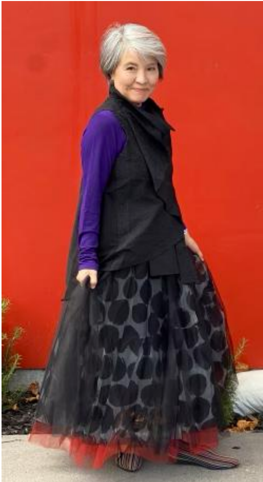
Purple turtle neck soft top, stylin' vest for fall, fabulous layered skirt!