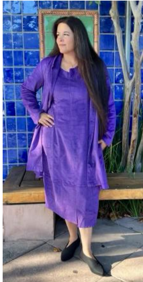
Royal Purple, corduroy dress and jacket. The Color Purple!

Citron - limited edition 25% off Yet Many/Most pieces (additional) 50% off!