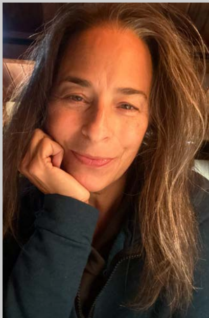
Bamboo/cotton/lycra Fleece The most comfortable fabric ever!