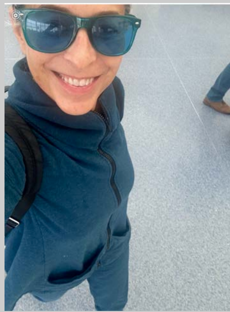
Zip jacket worn with Poet pant. in this comfy fleece

Hours: Berkeley: Every day 11-5ish 510 527 1945