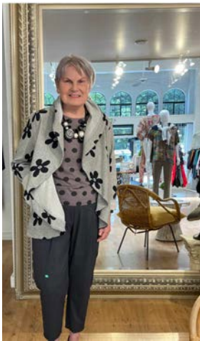
Our long time LoveTriber, picked out this floral knit jacket and fun necklace. (MV store in mirror)