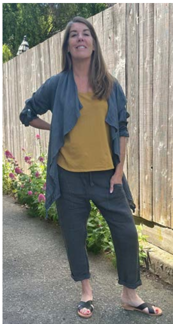
Devitalia linen Jacket and hipster pant, OB organic cotton tank