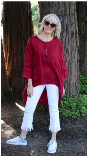
Devitalia linen top Charlie B pant