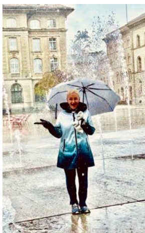
Same coat as previous black one but on it's reverse side!