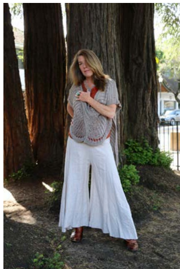
Devitalia tank, pant, sweater, Tara turquoise heart ring, Turkish silver necklace, Cowboy boots MV