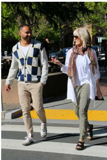
Sweater by a British designer, cotton/lycra pant, Devitalia Linen, Devi scarf, xcvi pant