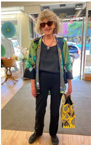
Our Ashland LoveTriber wearing her new Citron Kimono.