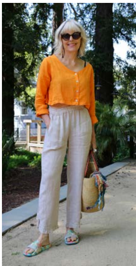
Devitalia linen crop top/jacket African shopper, JW slides