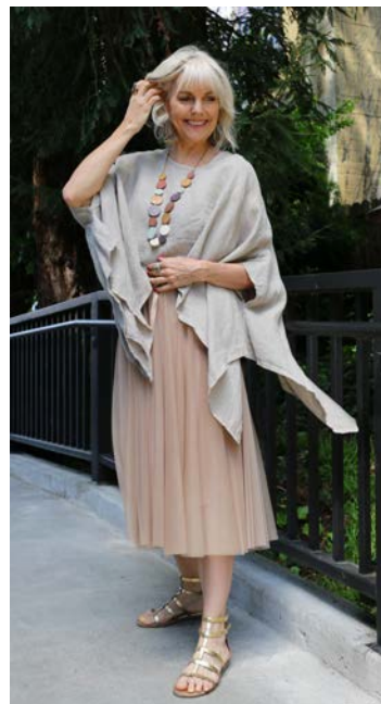
Devitalia linen Kimono top, wood necklace, Italian tulle skirt