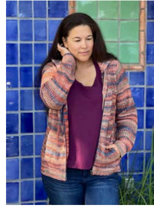
CharlieB sweater Outback organic cotton Tank Top