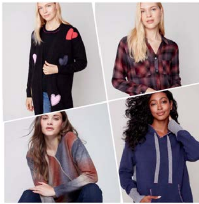
Charlie B sweaters, pullover and cardigans (and plaid shirt) Much more in store!