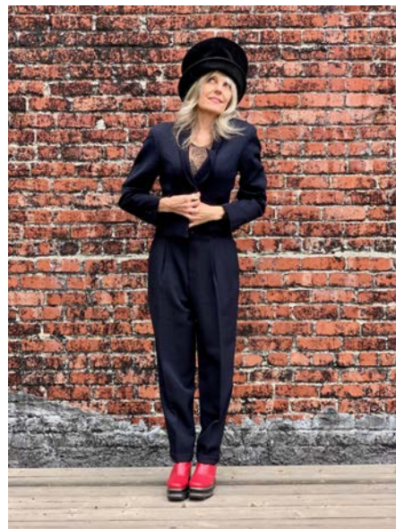
Comme des Garçons suit with "Madonna's" hat and Italian designer wedge shoes.

Outback ... In the Temple of Venus | 1799a 4th St, Berkeley, CA 94710