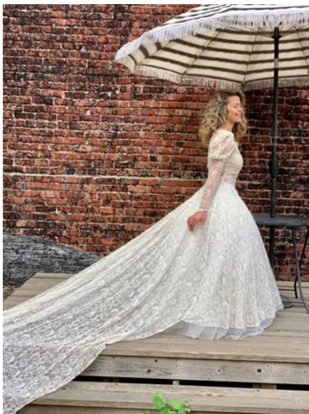
Vintage lace wedding dress with small satin buttons up the back with vintage crinoline slip.