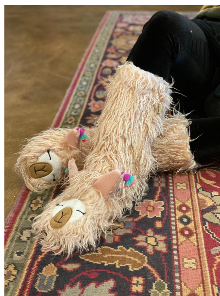
Llama slippers $22

Ashland 541- 7080695 to order. They can be shipped with a message or picked up curbside (call when out front of any of our shops) and some masked goddess will deliver.