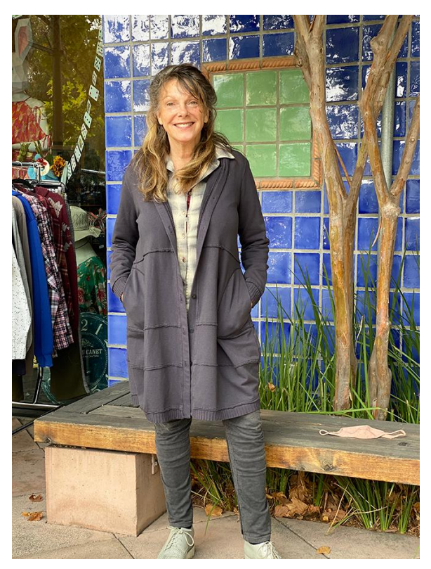
Devi wearing new Fenini cotton knit coat Fenini 20% off with Password: LoveTribe

Now for our deep dive into our liquidation/Semi-Annual and fall sales. We are in our final discount of additional 50% off, plus all the other deeper discounts we have now taken and will continue to take as we liquidate to build our reserves for whatever is to come.