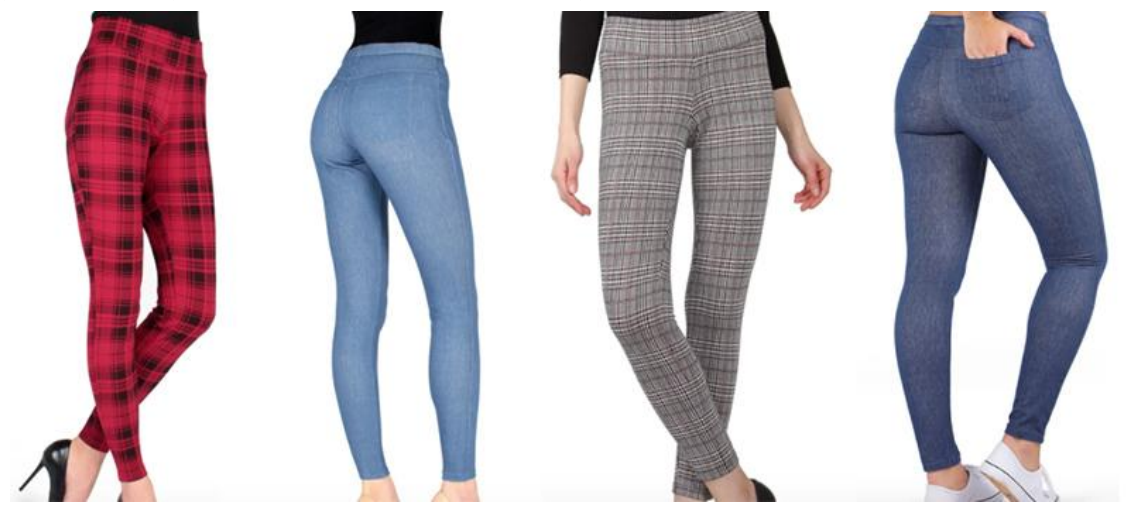
A bit of retail therapy, a bit of newness for fall, a lot of support for keeping us around!

We also have received fall goods that we ordered at the trade show in February, though we cut down the quantities (so the sooner you check them out the better). Like this comfy knit, stylin' coat I put on to show you, plus pants and tops in beautiful colors (Red dusty purple, olive, gold) and flattering designs. Upgrading your "sweats" for this season. We also just got in new leggings in many different knits (corduroy, ponte, fleece, denim, plaid, shapers). Many with back pockets I find handy.