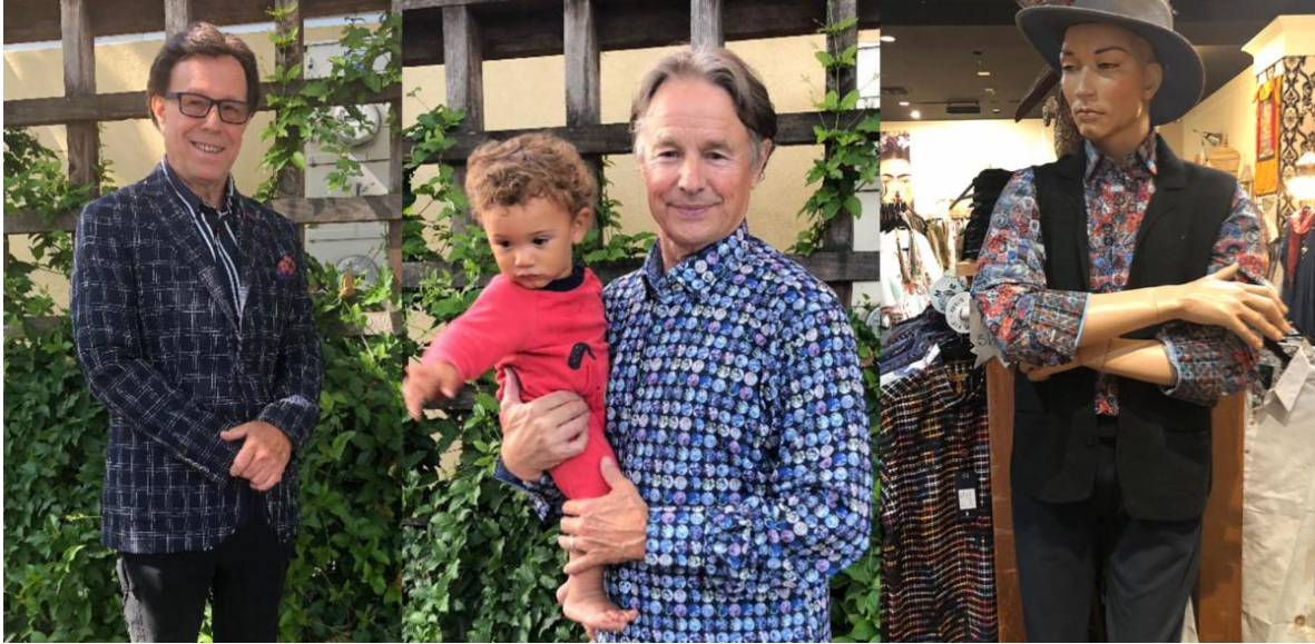
Blazers, Vests, Shirts by Luchino Visconti

Fun masks and horns to explore, expand and enjoy yourself this holiday season (or just for a romp in the woods ;)