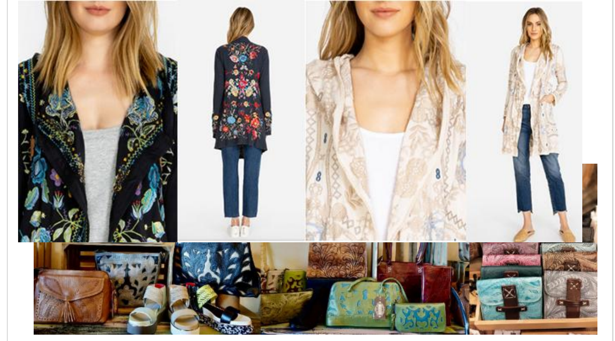
Beautifully crafted Leaders in Leather bags 50% off (with the additional 25% off)