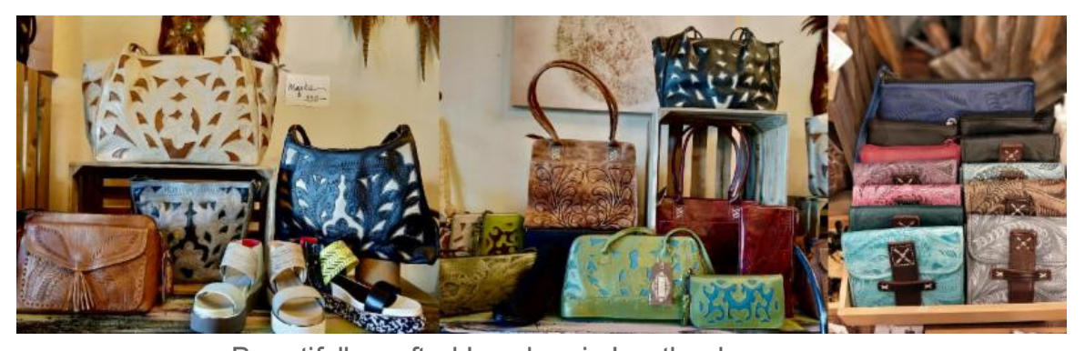
Beautifully crafted Leaders in Leather bags