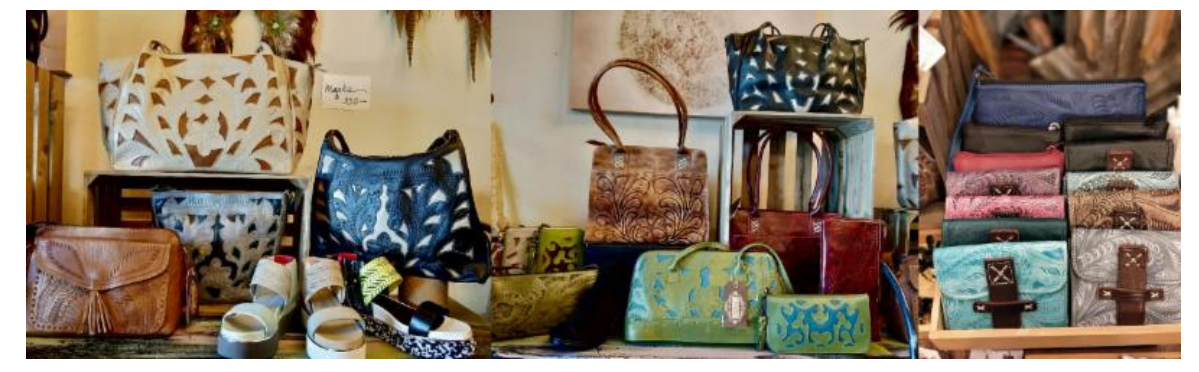
Beautifully crafted Leaders in Leather bags