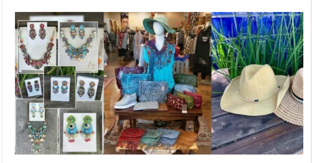
Ayala Bar Jewelry, Leaders in Leather bags, JW shirt, scarves, United Nude shoes, hats