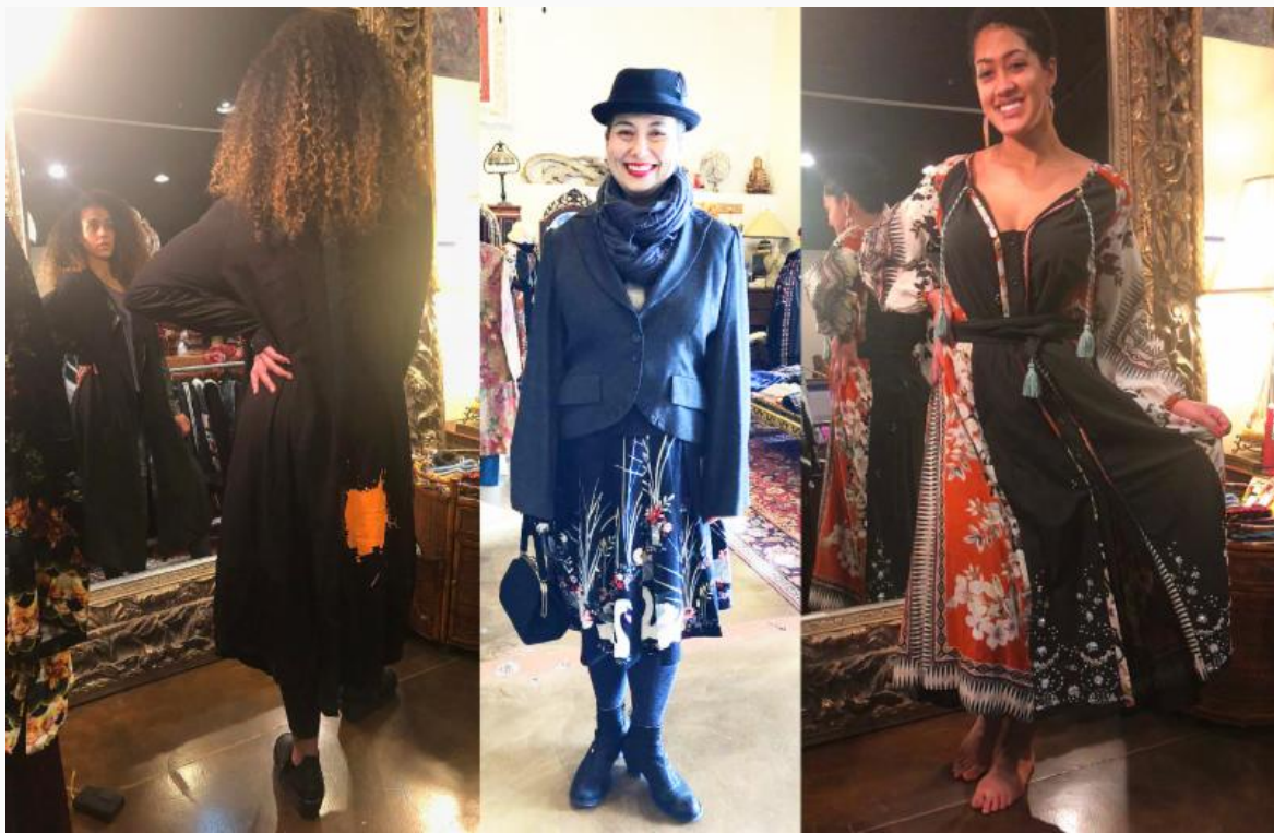
a couple of my favorite European designer pieces.