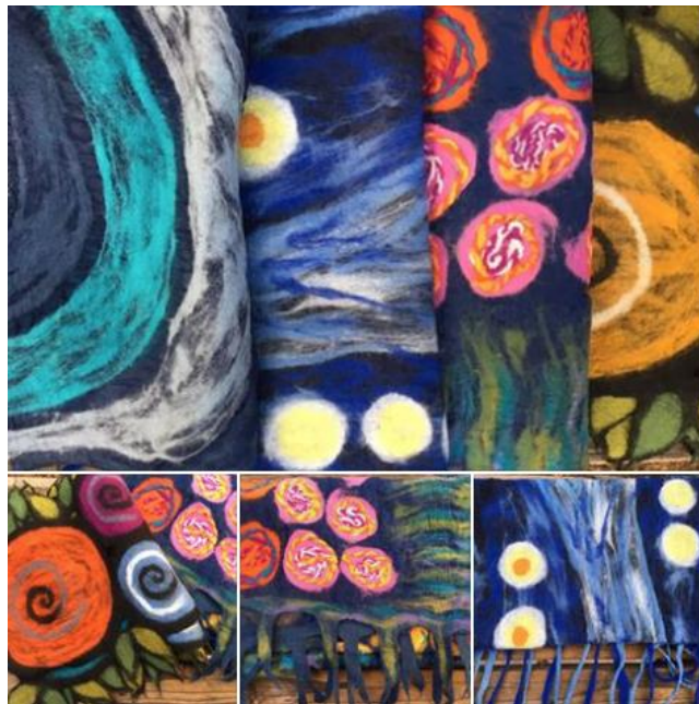
hand made felted wool scarves

For those displaced by the fires we're offering a special 30% off and a FREE piece of clothing from our outside racks (this weekend only!).