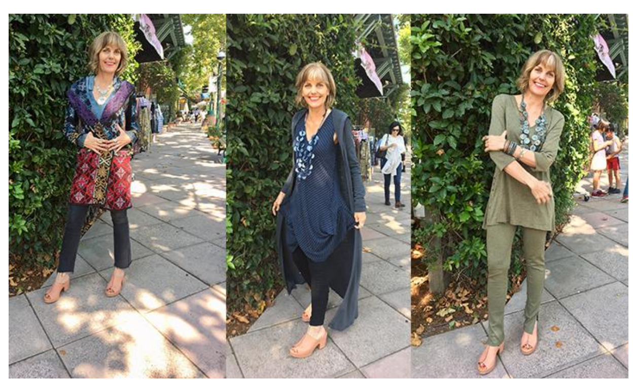
Biya coat, Giselle dress withNor coat Indigenous organic cotton outfit