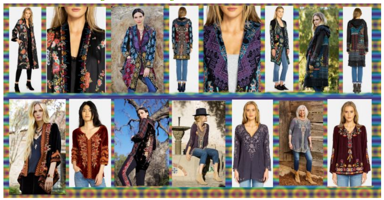
So many NEW Shirts ... Eight X, Mizumi, Luchino Visconti, Rock Roll N Soul