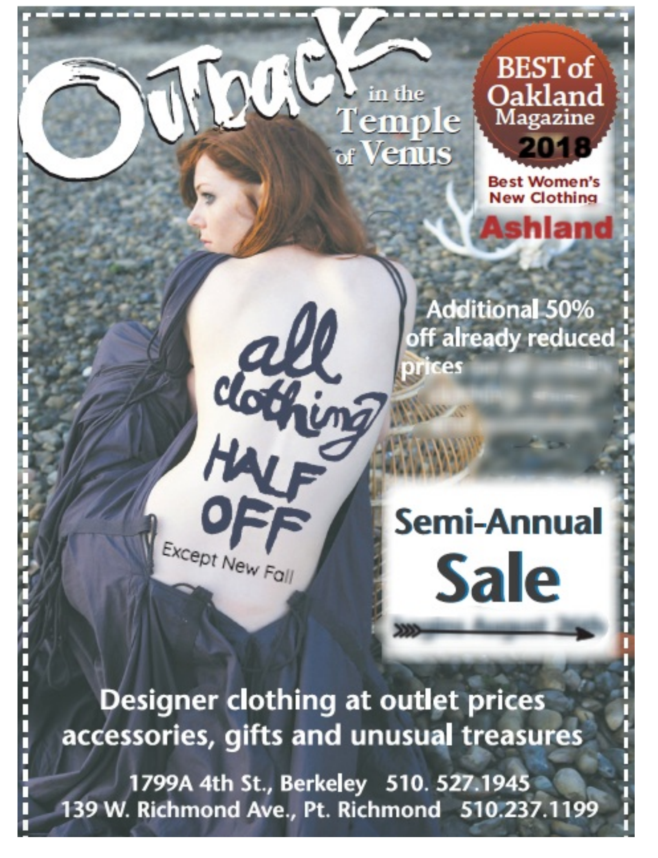
Semi-Annual 4th St Sidewalk Sale this Sat