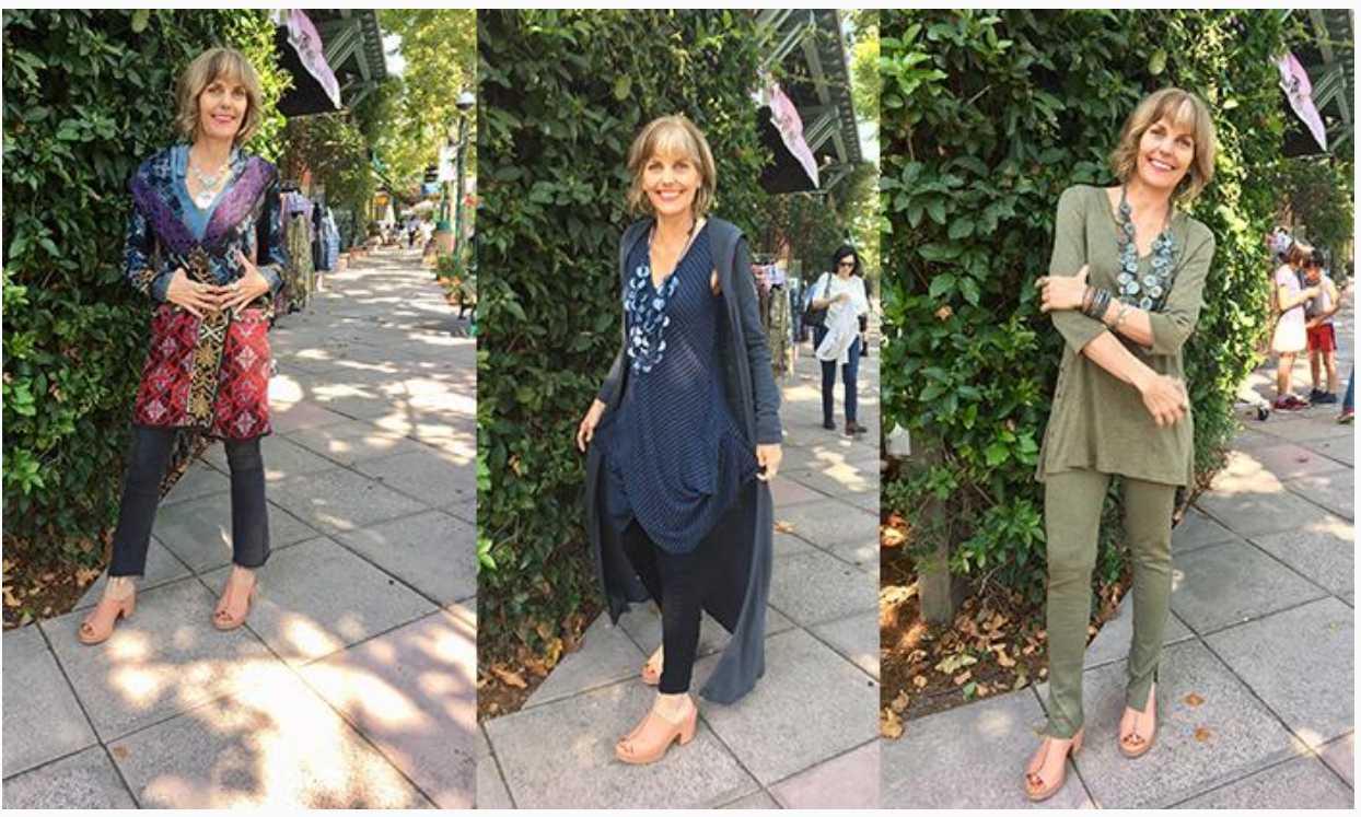
Biya coat, Giselle dress with Nor coat, Indigenous organic cotton outfit