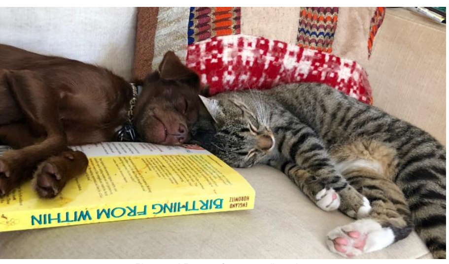
Piper and Boots after wrestling play

At Outback we're making a seasonal merchandise change! This gives you an opportunity for huge discounts on past treasures and current fall merchandise. My intention is to dress our community for the season, our stories unfolding. This new season may we embark on a path of worth, self worth and appreciating the worth of all. of life.