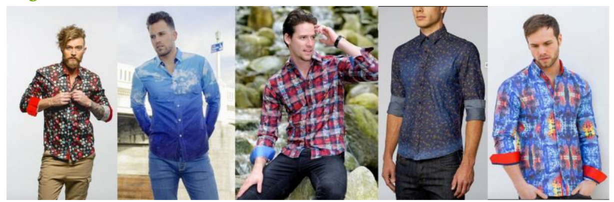
Indigenous Fair Trade Clothing Organic cotton ... so soft! Alpaca ... even softer!