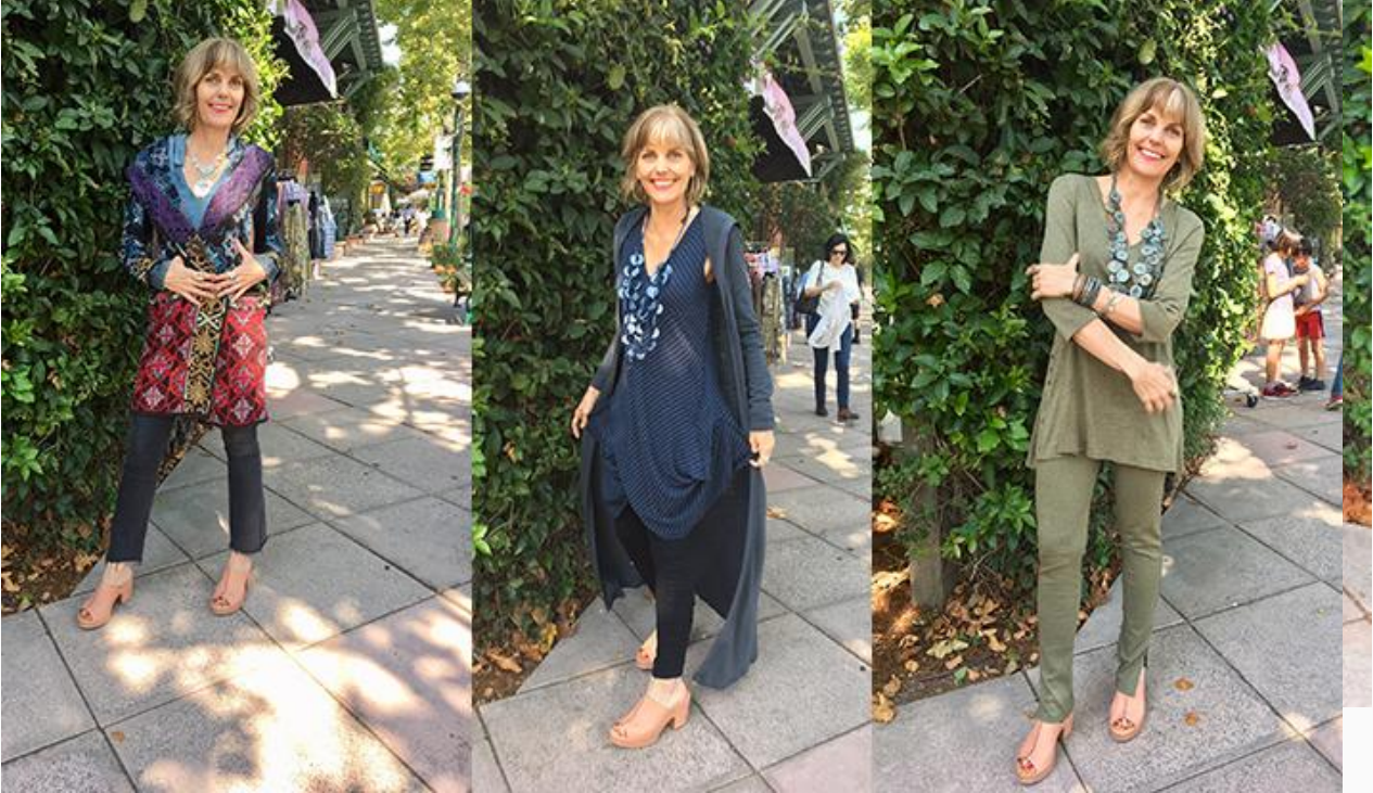
Biya coat, Giselle dress with Nor coat, Indigenous organic cotton outfit