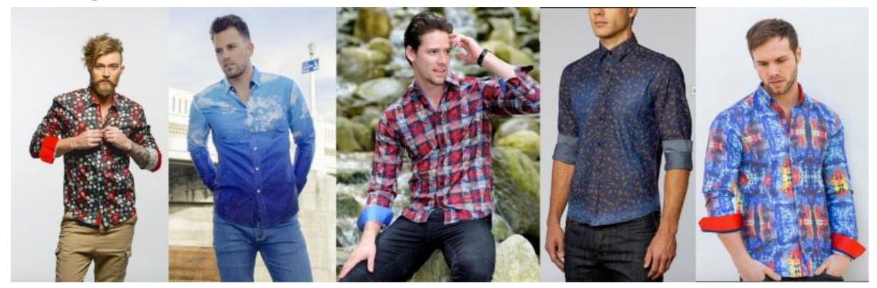
Indigenous Fair Trade Clothing Organic cotton ... so soft! Alpaca ... even softer! Many styles ... sorry no time for photos!