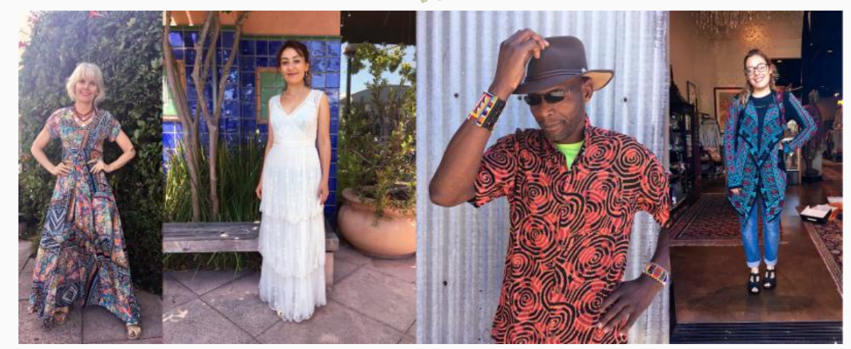
New Men's shirts now in! I heard you!