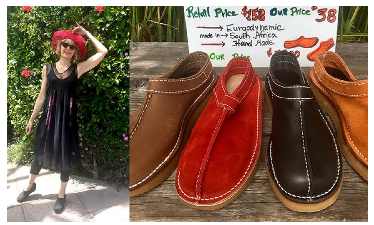
JW Dress, Bernie Mev Shoes, Sunhat I picked up in a craft market in Ibiza, South African hand made and sewn, ergonomic shoes.

also be worn as a dress. The top is actually a great dress above the knee. This also comes in a 3/4 sleeve version. This dress is made casual with these comfy shoes, bracelet and tribal necklace, worn by Heather.