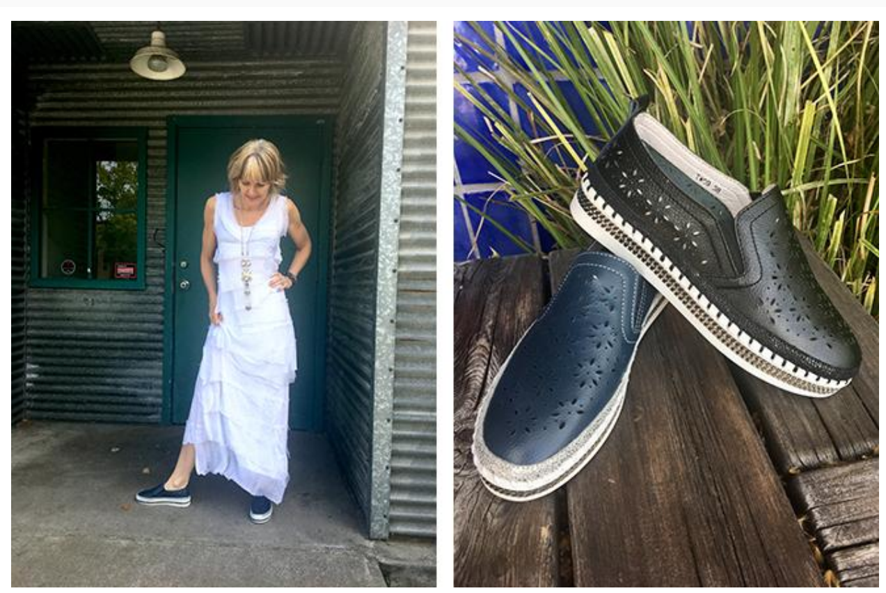
My favorite "dress" this season, worn dressy or casual and incredibly comfortable AND flattering for sizes S-1X. This 2 pc dress can be worn in many ways. The long skirt can