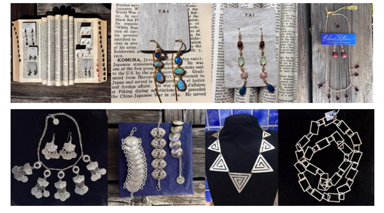
Fun statement pieces at great prices made in Turkey