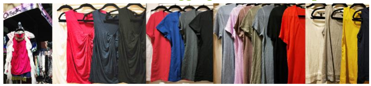
Fabulous soft modal, modal/cotton and linen slub