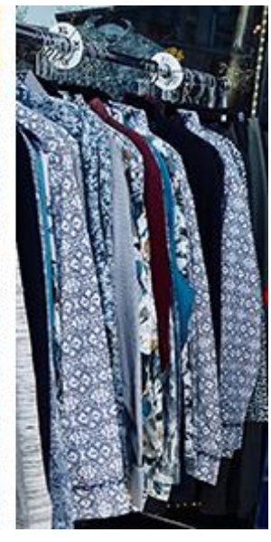
These fabulous shirts normally sell at around $59