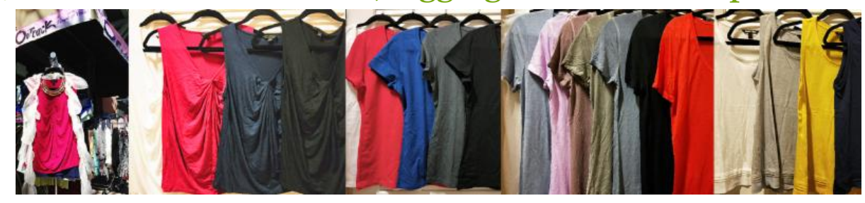
Fabulous soft modal, modal/cotton and linen slub