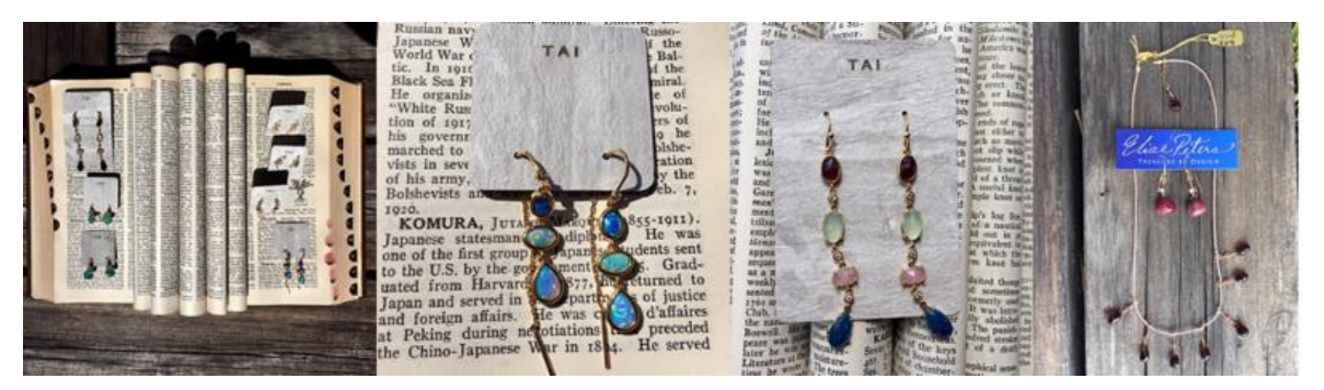
Delicate gold filled with semi-precious stones by small biz designers