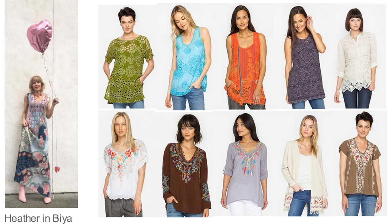
dress ... those balloons in Berkeley mean additional 50% off! LOVE