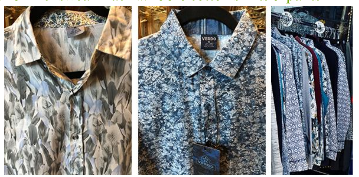
These fabulous shirts normally sell at around $59