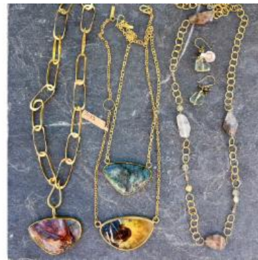
necklaces from Roost