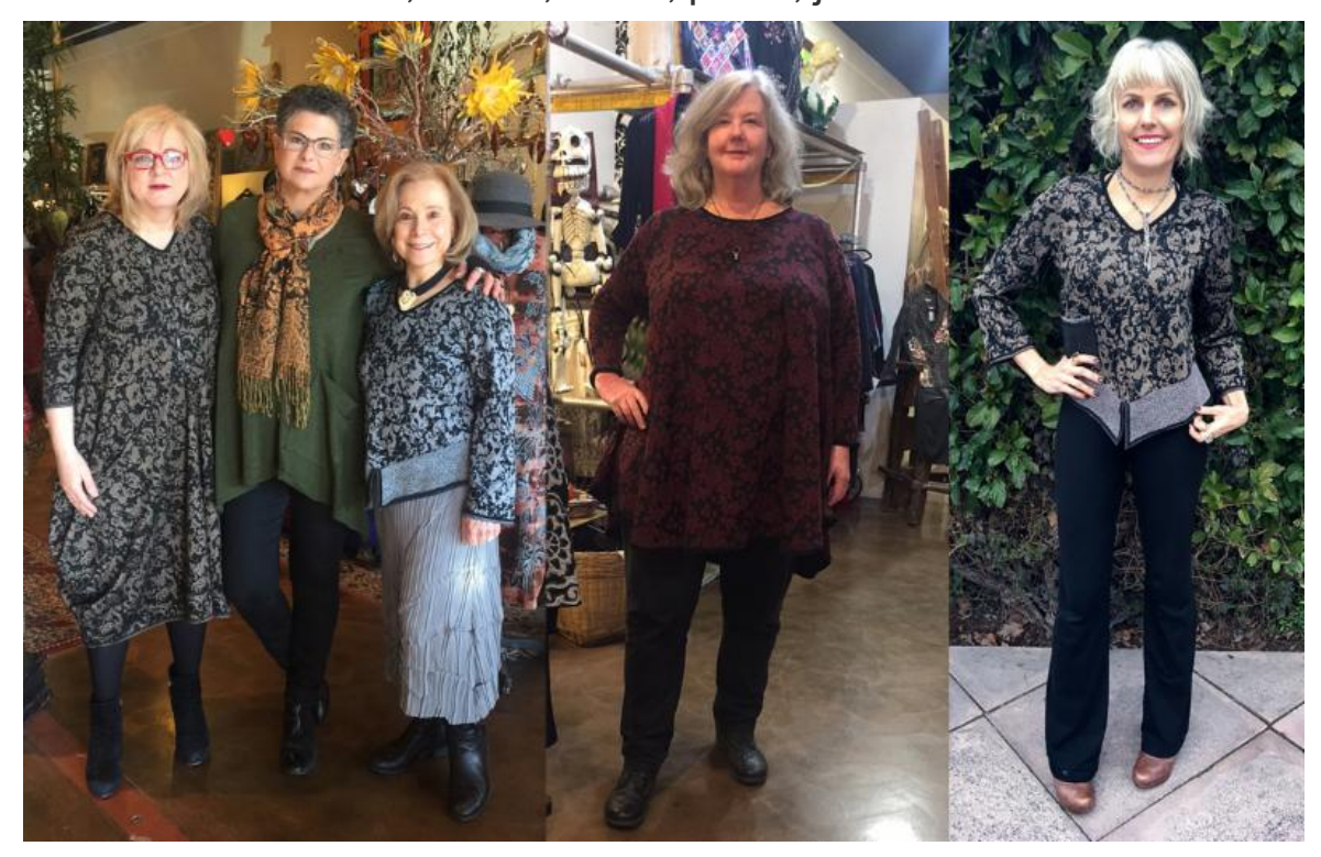
Noblu Crinkle knit styles ...