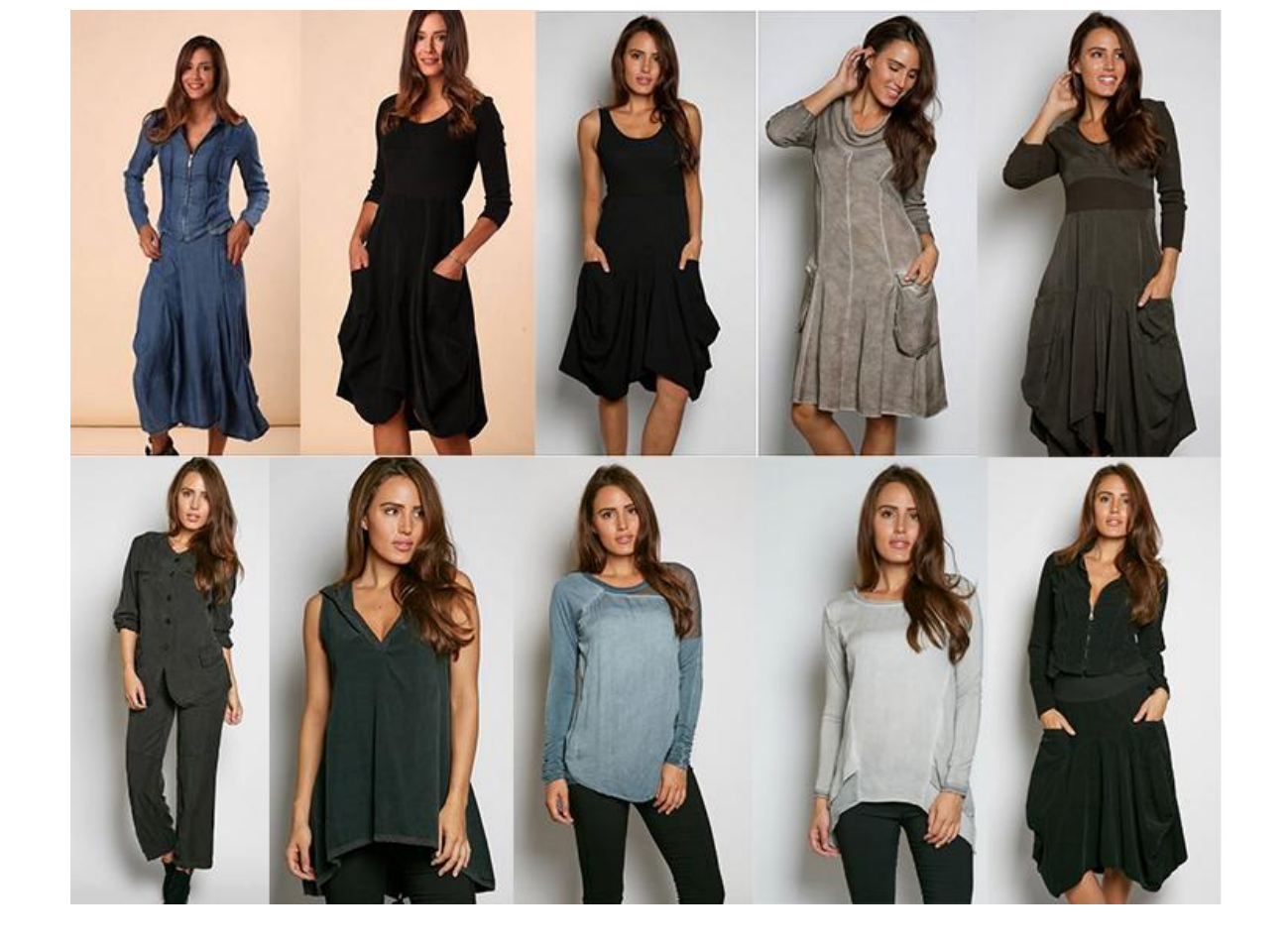
Karen Klein Locally made, natural fibers ... with LoveTribe discount dresses & tunics $34 (reg $108-$289) Tops, skirts and pants $24 (regularly $89- $189) A few of many styles below ...