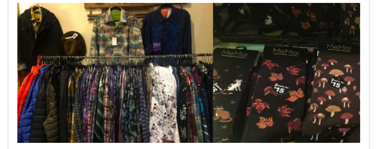
Deca & Sunlight (and other French clothing)