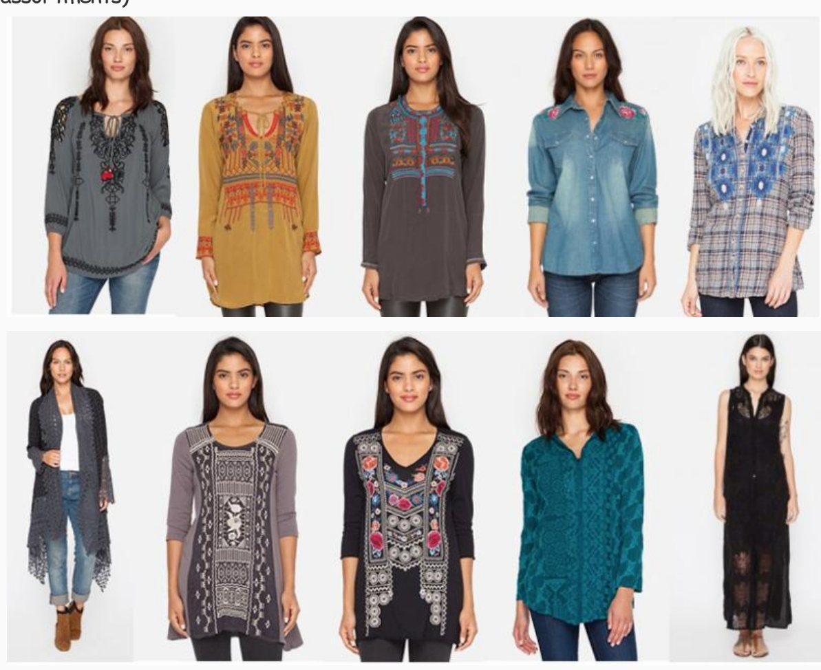
A few of our Biya, Johnny Was styles ... plaids, velvets, silks, rayon, cotton (eachTemple/Shop has different assortments)