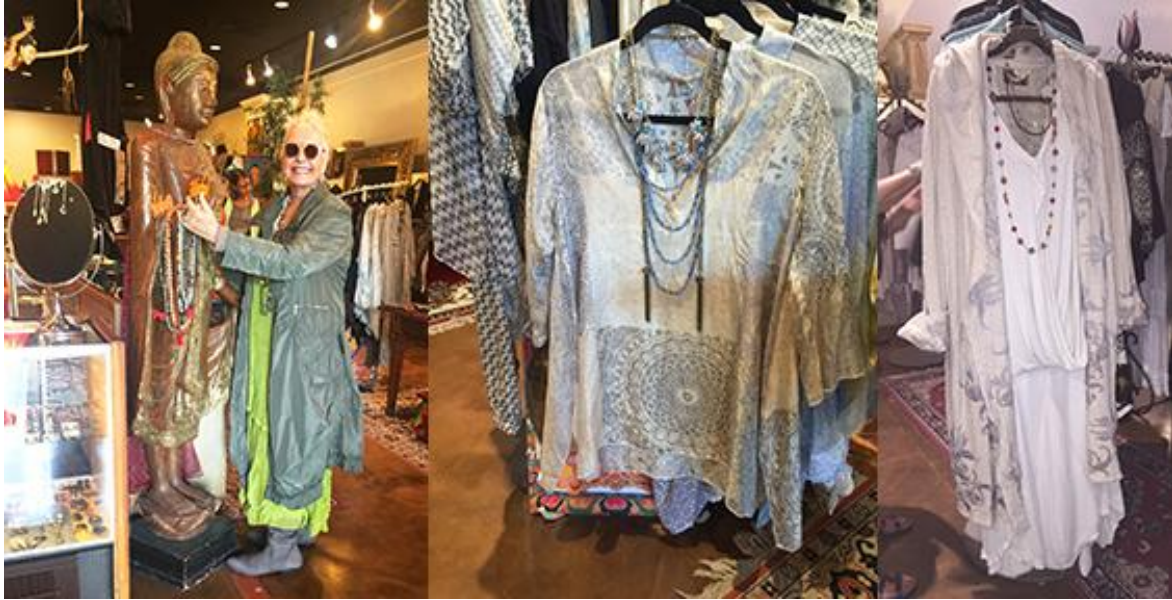
Our Stylist goddess of many names, wearing Deca dress and Pile ou Face Coat Biya silk blouses, Biya embroidered knit cozy coats

All shops : New Sunlight ... dresses, jackets, pants, vests