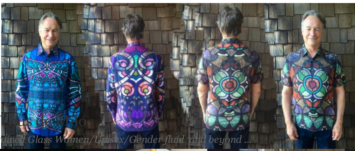
Venus de Milo Stained Glass Women/Unisex/Gender fluid and beyond ...