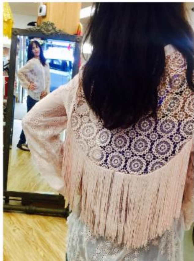
A peek into 4th st Temple/Shop ...