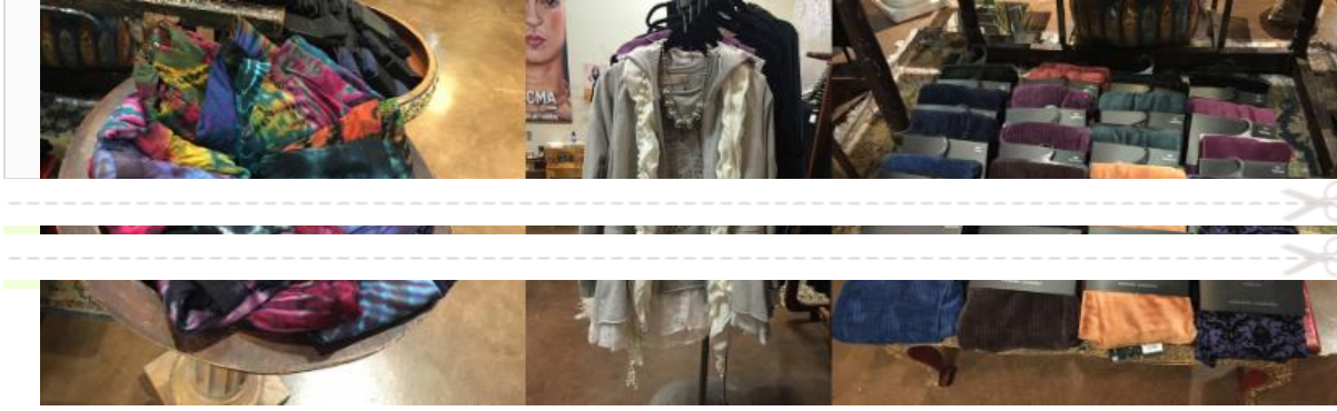
Tye dyed rayon/lycra leggings, cotton sweatshirts (scarves and necklaces) And a fresh order of our popular cotton/lycra corded and (new) flocked, leggings